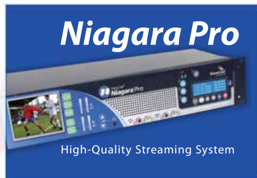
High-Quality Streaming System

Now you can encode customized streams for intranet users, high-speed Internet users, dial-up users, and users with mobile devices – all at the same time! You can size and scale each individual stream, and separately "brand" each stream with bitmap overlays (e.g., logos).